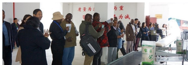
Visit at a rice processing line.

enabled direct exchange among the participants and Chinese providers of solutions for post-harvest treatment and storage management. The workshop provided a starting point for the participants to strengthen institutional capacities in these areas and to develop a " peer network " with experts from other developing countries that are facing similar issues. To learn more, please contact, Qiang.Li@wfp.org , WFP China Centre of Excellence.