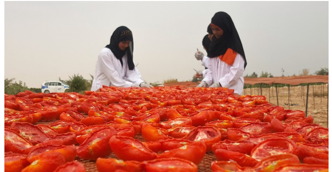
Project experience that may form the basis for showcasing at the Luxor Collaboration Hub.

Country Office is supporting Egypt on the establishment of a collaboration hub in Luxor . The hub aims to facilitate collaboration among different Egyptian government and civil society institutions, partners for academia and research, as well as the local community. As a flagship initiative for the achievement of Egypt's development goals, it helps to showcase successful development approaches to the rest of rural Upper Egypt. For more information, contact Ithar.Khalil@wfp.org in the WFP Egypt Office.