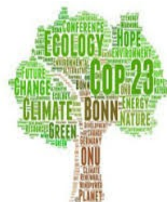
COP 23.

As a key outcome, a Communique on Joint Action for building smallholders' resilience to climate change through South-South Cooperation was released. Click here to read more.