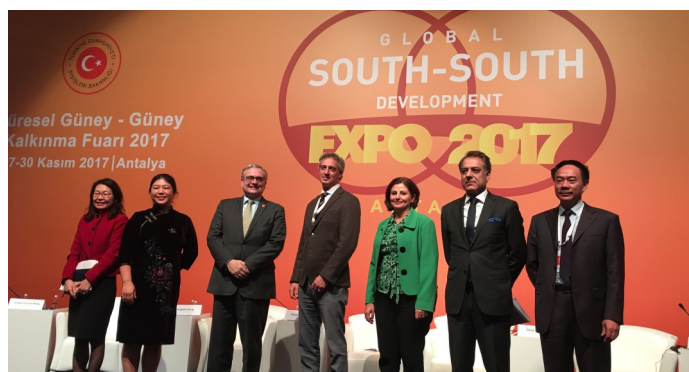
Thematic Forum on Country-Led Progress to Zero Hunger through Joint RBA Efforts.

The RBA presented a joint roadmap on South-South cooperation initiatives in 2018/19 which aims to strengthen the collaboration amongst the three Agencies in facilitating South-South Cooperation. The RBA already share a common vision and overall framework for collaboration for an effective implementation of the 2030 Agenda for Sustainable Development. The RBA roadmap builds on this effort and provides a basis for joint brokering of South-South