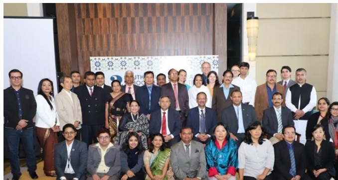
The 2nd South Asia School Feeding Meeting in New Delhi.

The WFP Regional Bureau for Asia and the Pacific (RBB) and WFP India in partnership with the Government of India (Ministry of Human Resource Development) hosted a regional meeting in New Delhi, India, on school meals in South Asia. Country delegates and their WFP counterparts from Afghanistan, Bangladesh, Bhutan, India, Nepal, and Sri Lanka spent three days exchanging strengths, challenges, and lessons from their national school meals programmes. Participants from WFP Headquarters, WFP Regional Bureau, USDA, and GCNF joined the event as technical and resource partners.