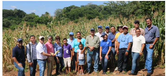
In-field demonstration in Honduras.