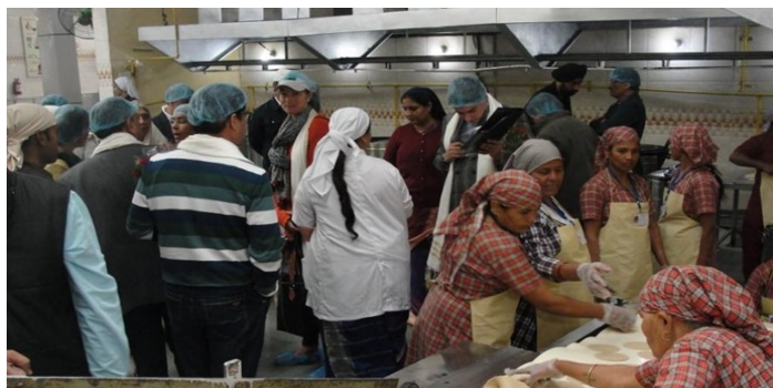
Delegates visiting central kitchens.