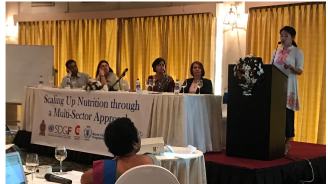
International experts sharing their knowledge and experience in food fortification with multi-sectoral stakeholders in Sri Lanka.

To facilitate regional knowledge sharing, participants from India and Bangladesh (Government and WFP) attended the workshop. They presented evidence, current status, and challenges of rice fortification in their respective coun-