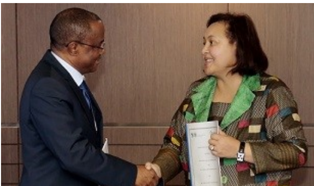
ARC Director General and Senior Vice President of the African Development Bank Group.