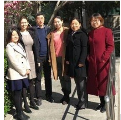
Photo: OSZ/ WFP China and OSZ SSC teams with MoA during the “South-South review” in Beijing.

For more information, you can contact: jia.yan@wfp.org , ywen.zhang@wfp.org (WFP China Office) or carola.kenngott@wfp.org