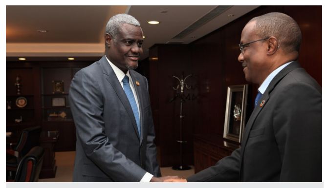
General Mohamed Béavogui and H.E. Moussa Faki Mahamat.

The African Risk Capacity (ARC) marked its 5th anniversary as a Specialized Agency of the African Union in November 2017. It is the leading institution in disaster risk financing, deploying innovative, objective and transparent parametric mechanisms that spearhead discussions around disaster risk management and climate change in Africa.