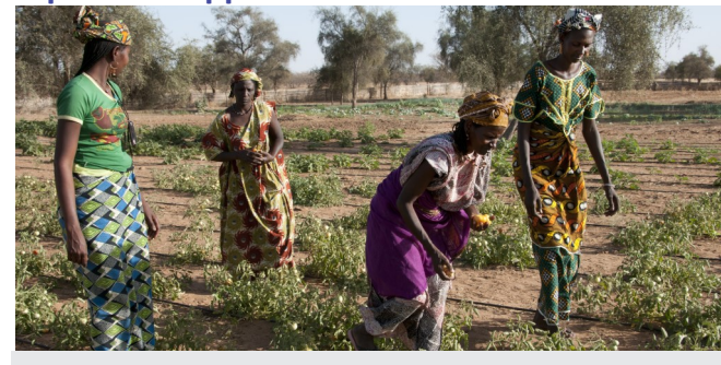
WFP Senegal

The mapping, which is supported by OSZ, builds on a series of consultations with selected Country Offices as well as with RBD Heads of Units. It also includes opportunities scoped through the engagement with WFP