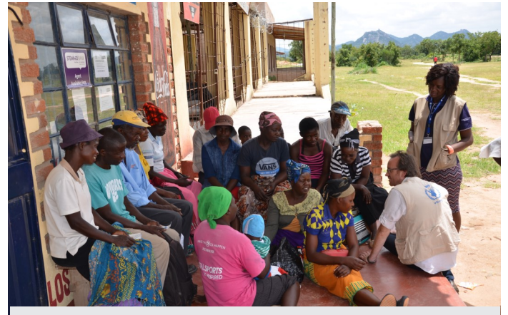
Mission participants interviewing beneficiaries at a local shop.

WFP Zimbabwe hosted a delegation from the Government of Namibia and the WFP Namibia Country Office in February, as they undertook a "lookand-learn mission" to see how different WFP programmes are being implemented.