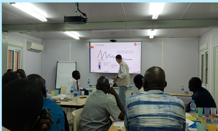
First round of training in Juba, South Sudan January 2019

For further information please contact: Karolina.Greda@wfp.org (WFP South Sudan).