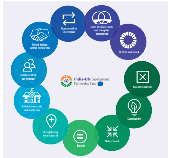
India UN Development Partnership Fund Report 2019, 5.