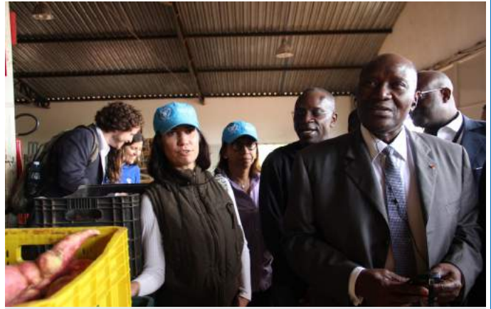
Vice-president of Côte d'Ivoire, Daniel Kablan

For more information, you can click here .