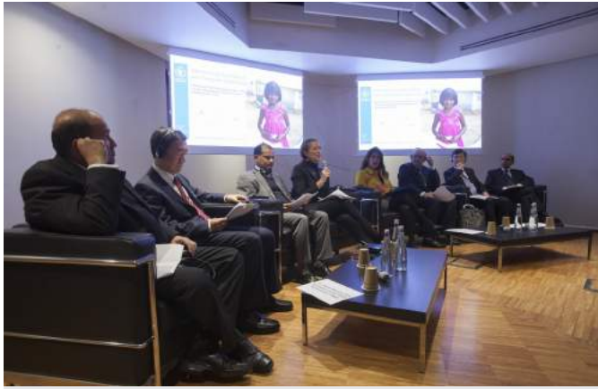
Photo: WFP side event on SSTC at the Annual Meeting of WFP's Executive Board.