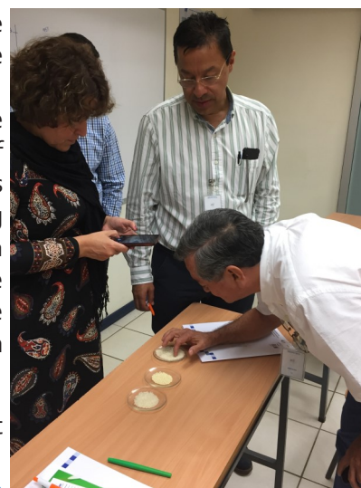
Rice fortification.

For more infos, contact maria.pino@wfp.org and carol.montenegro@wfp.org in RBP.