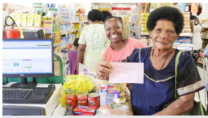
Cash transfer as part of the response to tropical cyclone Winston in Fiji.

For further information, you can contact Kimberly.Deni@wfp.org , SSC focal point in RBB.