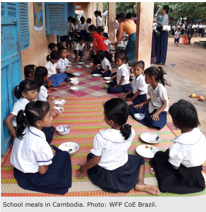
School meals in Cambodia.

1) Strengthening national ownership for school meals in Cambodia : The Government of Cambodia held a school feeding consultation workshop on 11-13 June. The WFP Centre of Excellence presented examples of school meals solutions from other countries, including Brazil. The presentation helped to inform the Cambodian government in its decision-making process to take ownership of their school feeding programme. Participants included government officials from federal and provincial levels. They revised the country's school feeding roadmap, and prepared a concrete action plan to transition the programme from WFP to the government. In order to implement it, the government requested further support from the WFP Centre of Excellence against Hunger in Brazil and the WFP Country Office in Cambodia. You can read more here.