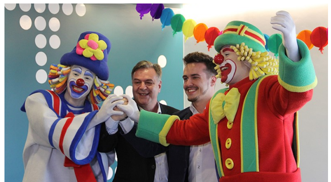
Innovative ways of partnership building, awareness raising and joint fundraising.

3) Adopting an innovative approach for raising awareness and mobilizing resources for zero hunger : The WFP CoE Brazil announced a partnership with Rinaldi Produções, a company managing a famous pair of clowns in Brazil, called "Patati Patatá". The two institutions have joined efforts to promote campaigns and raise funds for initiatives to fight hunger in Brazil and in the world. Patati Patatá is a pair of clowns which is very famous in Brazil. For over 30 years, they have been offering quality entertainment to children and their families, including through animations, songs, concerts, circuses and a television show, with wide reach throughout Brazil and Latin America. The partnership with Patati Patatá will help the WFP CoE Brazil to raise visibility for WFP's mission, promote key messages among Brazilian audiences and to raise funds.