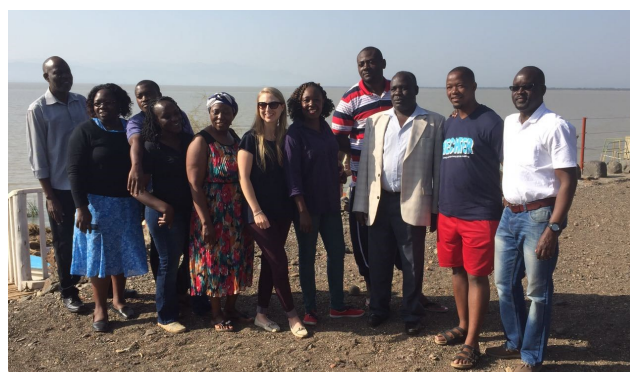
Photo: Home Grown School Meals Programme exchange visit to Kenya.

The visit by the Southern African delegation also supports the implementation of the AU decision on school feeding and the Continental Education Strategy for Africa .