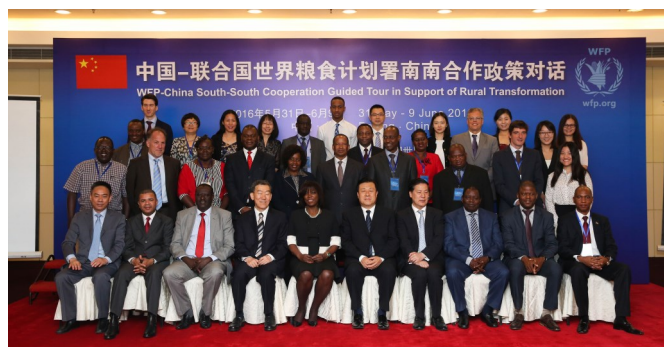
WFP's Executive Director, Ertharin Cousin (centre) with delegates at the WFP-China South-South Cooperation Policy Dialogue Tour.

On 4 June 2016, a China-RBA (Rome-based Agencies) Roundtable Meeting on South-South Cooperation was held in Xi'an where WFP Executive Director Ertharin Cousin delivered a keynote speech. The Roundtable was held to discuss how to strengthen the South-South partnership between China and the RBAs, foster innovative cooperation mechanisms, and take joint actions to contribute to global food security, poverty alleviation and the implementation of the 2030 Agenda for Sustainable Development.