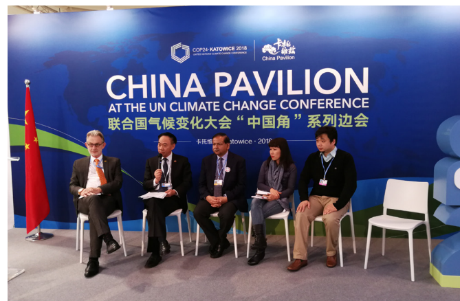
partnership building with private sectors in China.

25. Apart from the above mentioned events, WFP China also attended: